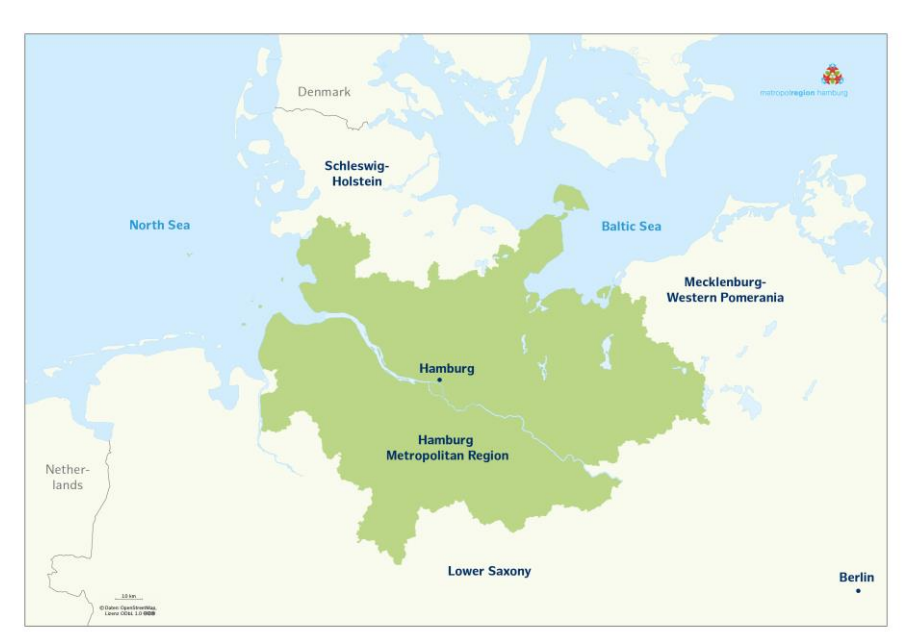
Hamburg Metropolitan Region Data: OpenStreetMap, Lizenz ODbl 1.0 1