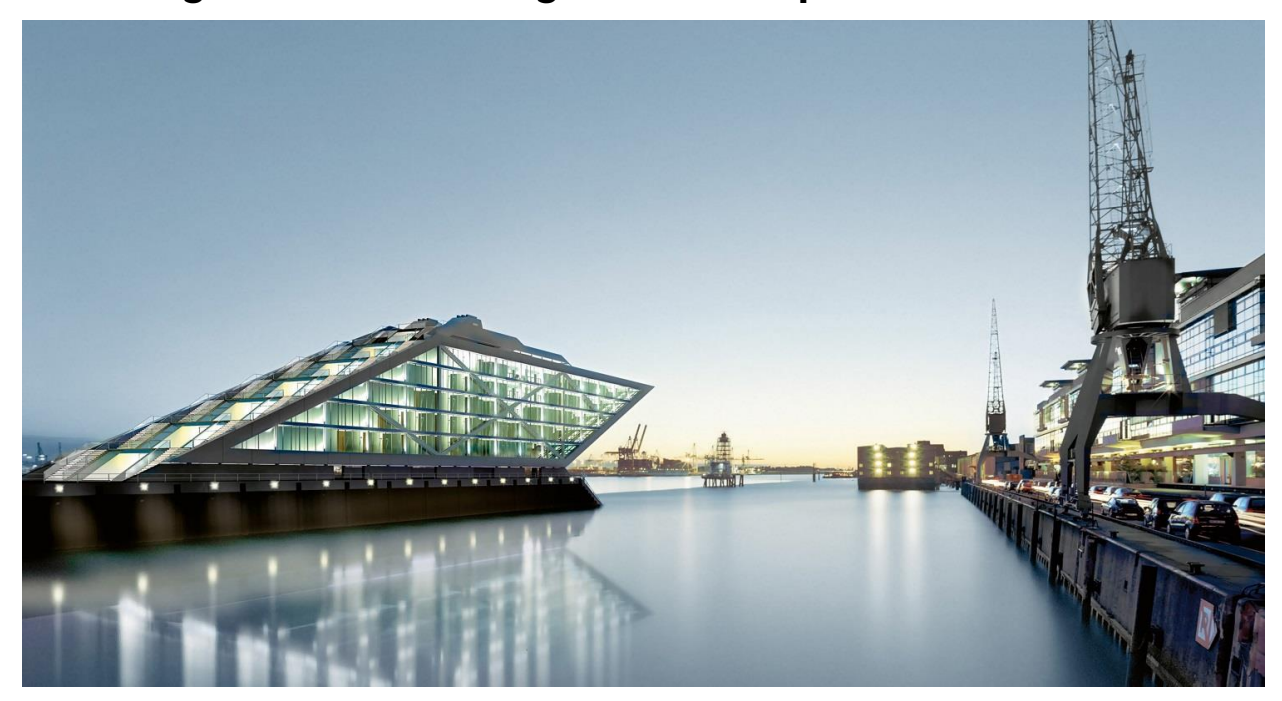
Dockland Hamburg

Hamburg is China's gateway to Europe and serves as the central hub for the New Silk Road – both on land and by sea. China has been Germany's number one trading partner for the fourth time since 2016. In 2019 alone, the bilateral trade volume amounted to more than €200 billion. Today, more than 50 percent of German foreign trade with the People's Republic of China is handled in the port of Hamburg, with more than 2.6 million container units (TEU) handled in 2019. Accounting for about one third of the volume of all containers handled in Hamburg, China is the number one foreign trade partner of Hamburg's port. In addition, the number of direct freight train connections between Hamburg and China is increasing steadily. Every week, there are more than 200 container train connections between Hamburg and China. Trade ties between Hamburg and China go back to the era of the Hanseatic League. In 1986, Hamburg was the first European city to twin with Shanghai, and the two cities continue to foster their lively partnership.